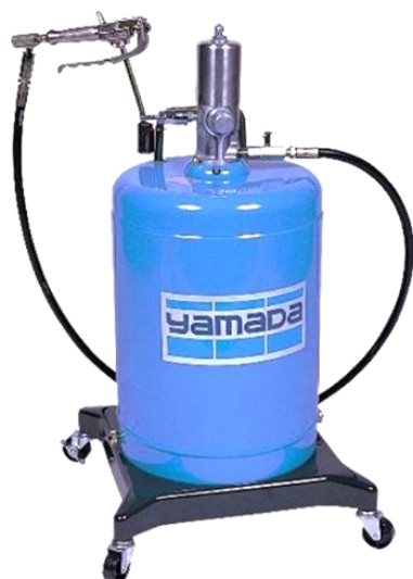
Current SKR-55 880870

The specifications of SKR-55 are changed. Please refer the detailed changes on the following page.