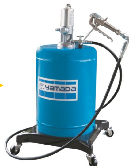
New SKR-55 (SKR-55EX) 881190